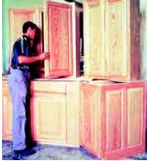
Kitchen cabinets are an important part of the value-added industry in Louisiana.

To help achieve our vision and mission, a five-year strategic plan has been developed. It incorporates five major program areas and an information dissemination plan. The program areas are Industrial Process Improvement, Environmental Assessment and Improvement, New Product Development, Business and Industrial Development, and Durability of Wood-based Building Products. Because expertise is needed from various disciplines, each program area involves multiple members of the LFPDC faculty. In addition, an integral part of each area is to develop relationships and incorporate expertise in disciplines across campus, in other universities, in industry and in public agencies.