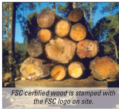
FSC certified wood is stamped with the FSC logo on site.