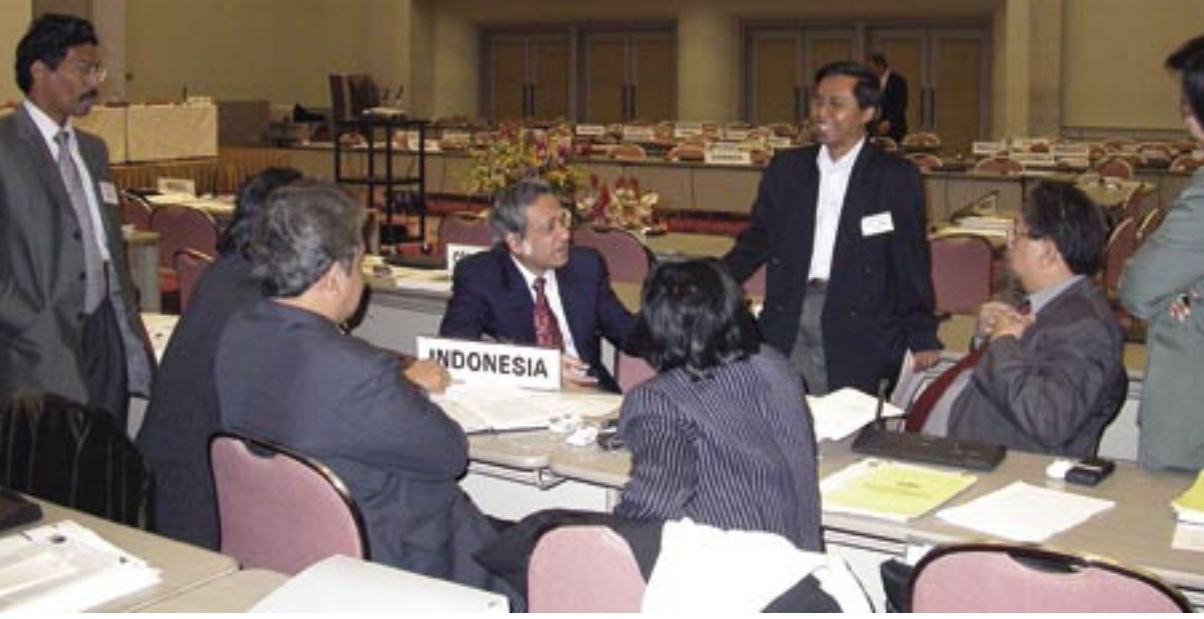
Dialogue: Indonesian and Malaysian delegates discuss an issue during a break in the 33rd Council session.

The most recent session of the International Tropical Timber Council financed further activities at the policy and field levels