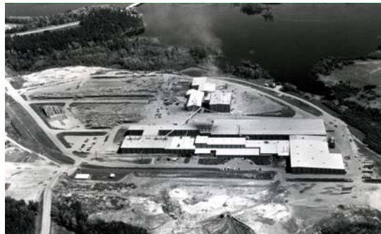
The sprawling, former Ainsworth site in Grand Rapids currently sits empty as do the Cook and Bemidji facilities.

its equipment still located on the site. Steve is currently pursuing an environmental review that should be completed prior to June. This study will determine what products will be viable options for