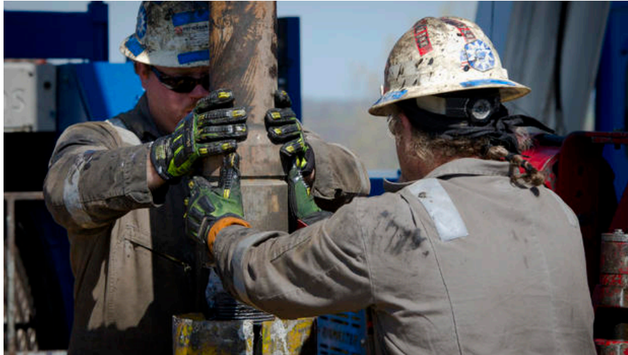
US-Energy-Gas-Environment Workers change pipes at Consol Energy Horizontal Gas Drilling Rig exploring the Marcellus Shale outside the town of Waynesburg, PA on April 13, 2012.

NORFOLK, Va. -- Over the objection of environmental groups and Virginia's governor, a federal management plan released Tuesday will allow a form of natural gas drilling known as fracking to occur in parts of the largest national forest on the East Coast.