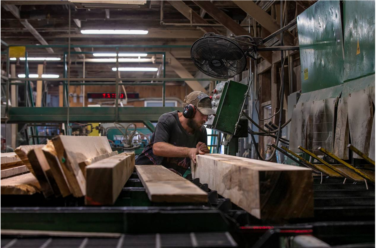
An employee inspects oak boards before they are sorted at Allard Lumber in Brattleboro, Vermont.

September 24, 2019 Updated Sep 26, 2019 9:18 AM <u>Wilder Fleming</u>