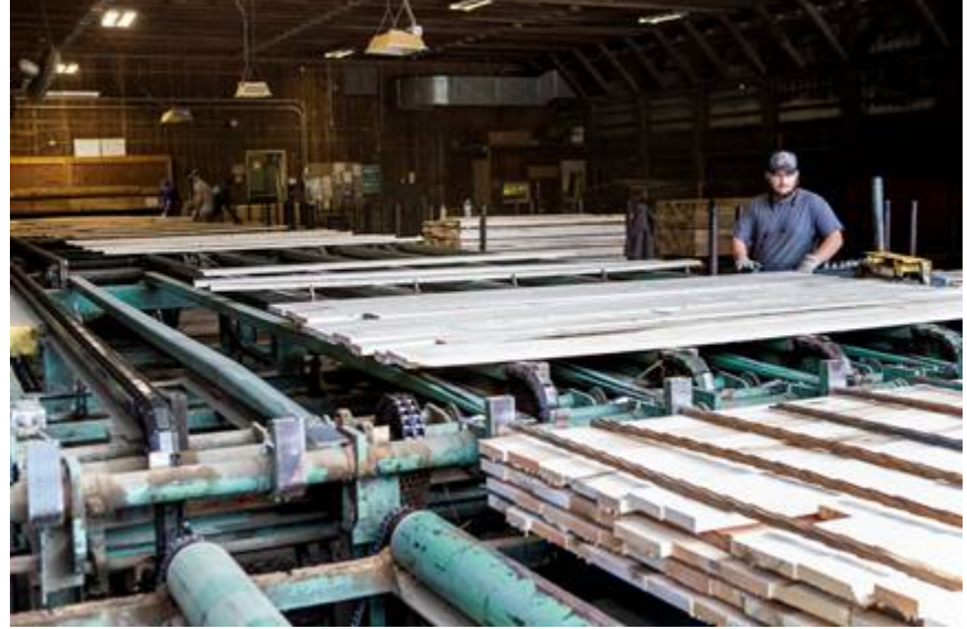
Oak boards are packed at Cersosimo Lumber.

SENT TO LSU AGCENTER/LOUISIANA FOREST PRODUCTS DEVELOPMENT CENTER - FOREST SECTOR / FORESTY PRODUCTS INTEREST GROUP