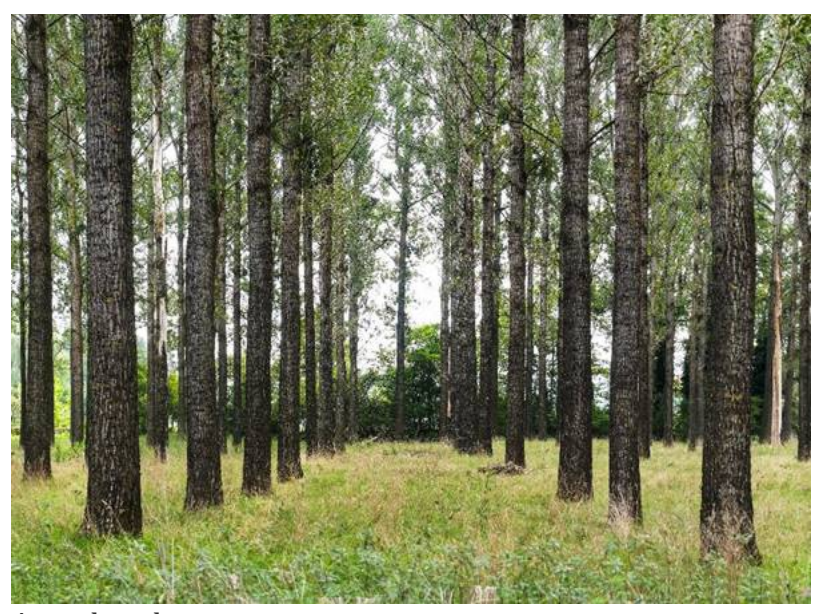
A poplar plantation

Well, poplar plantations cover 9.4 million hectares (more than 36,000 square miles) globally, including in the Pacific Northwest and Midwest in the United States. And worldwide, that's more than double the land used 15 years ago. The trees grow fast and are a source of biofuel and other products including paper, pallets, plywood and furniture frames.