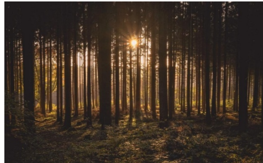
The Forest Certification Experience - A Commentary by Dovetail Partners