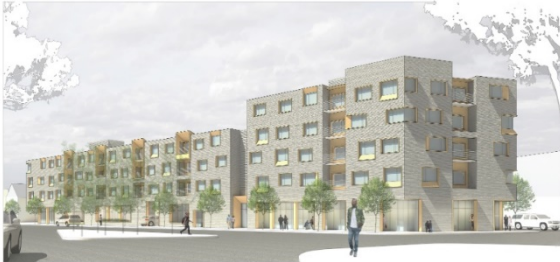
Affordable Housing Opportunities with Mass Timber

SENT TO LSU AGCENTER/LOUISIANA FOREST PRODUCTS DEVELOPMENT CENTER - FOREST SECTOR / FORESTY PRODUCTS INTEREST GROUP