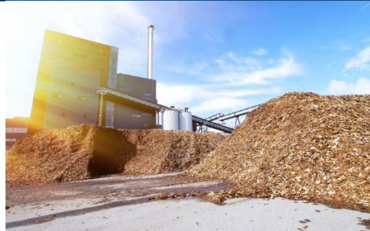
Biomass Energy: A Climate, Conservation, & Livelihoods Challenge