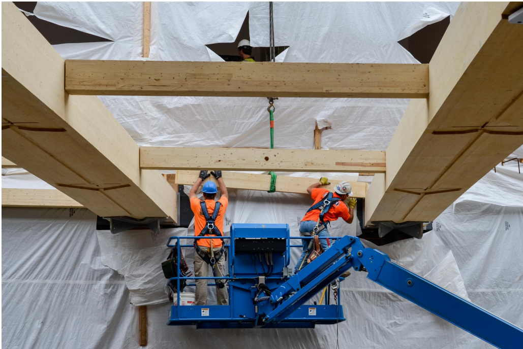
John W. Olver Design Building, UMass Amherst, Leers Weinzapfel Associates

We're excited to announce the release of our new U.S. Mass Timber Construction Manual! With so many developers and design teams pursuing mass timber, there is a critical need for practical training and education to help general contractors successfully bid and complete projects.