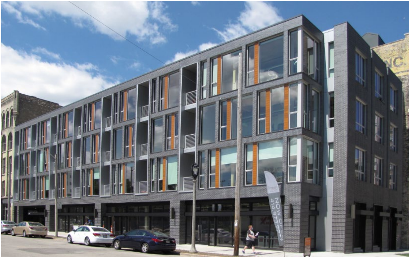
Timber Lofts is featured in new Mass Timber Business Case Studies. Engberg Anderson Architects & ADX Creative