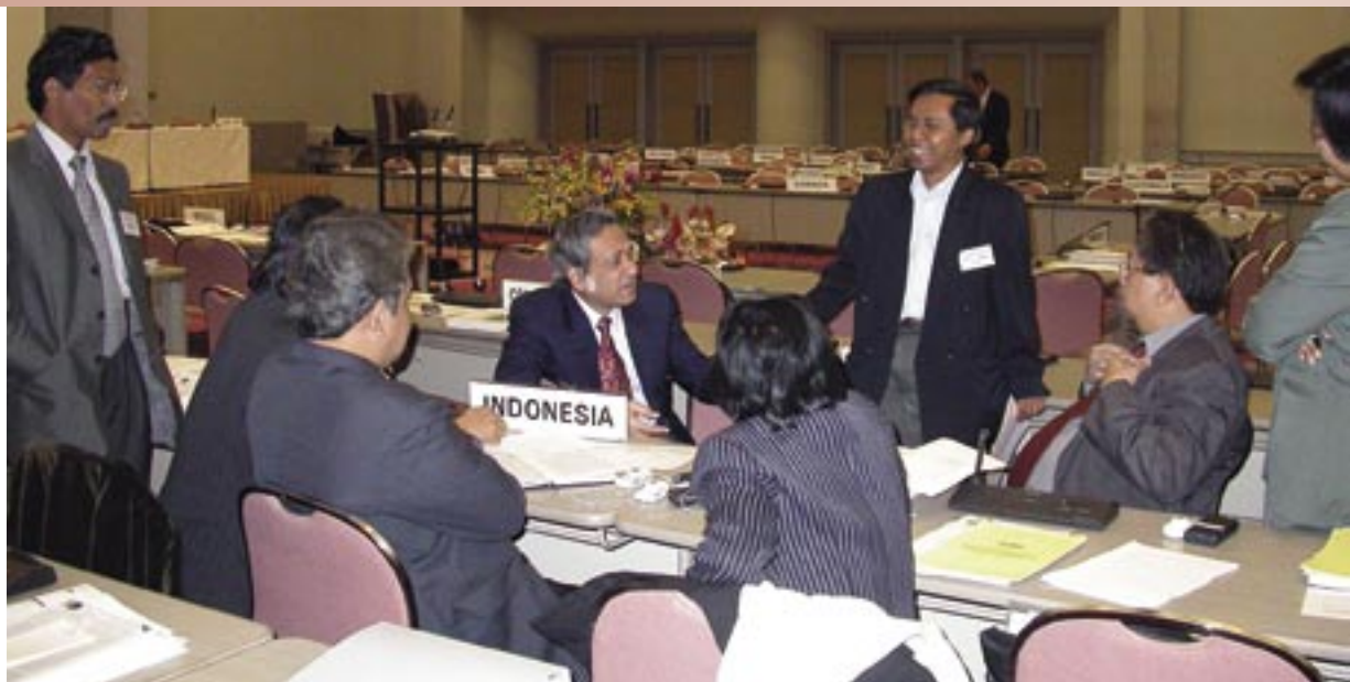
Dialogue: Indonesian and Malaysian delegates discuss an issue during a break in the 33rd Council session.

The most recent session of the International Tropical Timber Council financed further activities at the policy and field levels